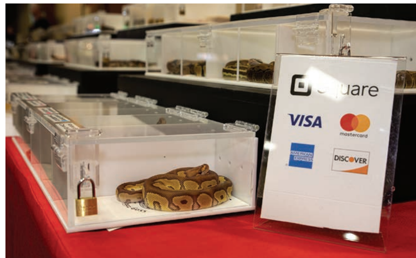
Photo right: At pet expos, Ball pythons are kept in small, tight containers, and handled by many visitors – a welfare nightmare for these animals.