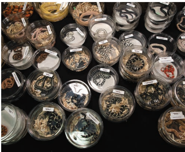
Photo left: Snakes kept for days in small, plastic containers while on display at a pet expo.

In Canada, an estimated 28,000 Ball pythons are kept in households as pets. 102 Their popularity in the pet industry is in part driven by pet stores, who contribute to the perception that the keeping of these animals is safe and simple. This misconception leads to tremendous suffering. Realizing that “most first-time buyers will purchase their exotic animal in a pet store and with 43% of first-time buyers admitting that their initial purchase was driven by impulse, 103 it is essential that we disrupt their purchasing journey before they take the first step.