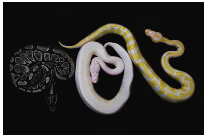
Photo above: Ball python designer morphs on display at a pet expo, Memphis, USA.

A “designer morph” Ball python is the creation of a breeder who has combined two or more “wild morphs” to create something never seen in nature. 91 Some breeders view wild-sourced Ball pythons from Africa as potentially valuable new genetic “stock” that can aid them in their efforts.